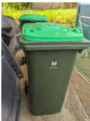
Our school has two new green waste bins.

National Recycling Week, established by Planet Ark in 1996, is held every year during the second week of November and this year, National Recycling Week explores the idea that Waste isn't Waste until it's Wasted. Being mindful about how we can recycle our waste not only keeps valuable materials out of landfill it also benefits the environment by reducing greenhouse gases.