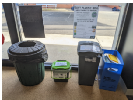
Each class has their very own 'Recycling Center' with general waste, paper, green waste and soft plastic bins.