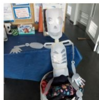
Meet our Skeleton made out of milk jugs!