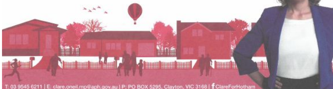
Clare O'Neil MP Federal Member for Hotham

T: 03 9545 6211 | E: clare.oneil.mp@aph.gov.au | P: PO BOX 5295, Clayton, VIC 3168 | f ClareForHotham