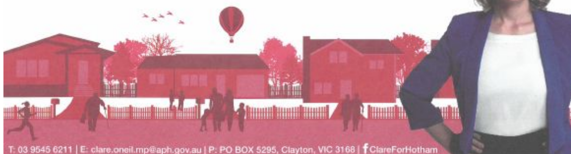
Clare O'Neil MP Federal Member for Hotham

T: 03 9545 6211 | E: clare.oneil.mp@aph.gov.au | P: PO BOX 5295, Clayton, VIC 3168 | f ClareForHotham