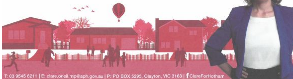
Clare O'Neil MP Federal Member for Hotham

T: 03 9545 6211 | E: clare.oneil.mp@aph.gov.au | P: PO BOX 5295, Clayton, VIC 3168 | f ClareForHotham