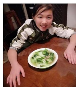
Annabelle 5/6 M