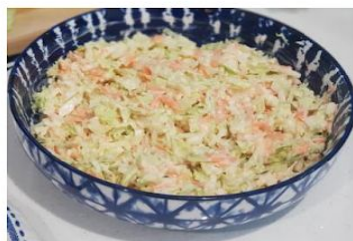
Salma 5/6 M