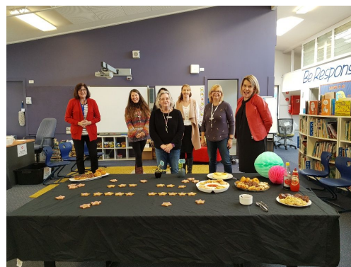
Shared morning tea with our ES Staff who are "Super Stars".