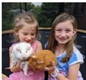
"On the weekend we cuddled the guinea pigs a lot" - Elsie R