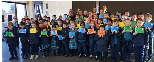
Term 2, 2019 House Points' winners..... WALLABIES

Congratulations to all our end of term award winners! You should feel very proud of your achievements.