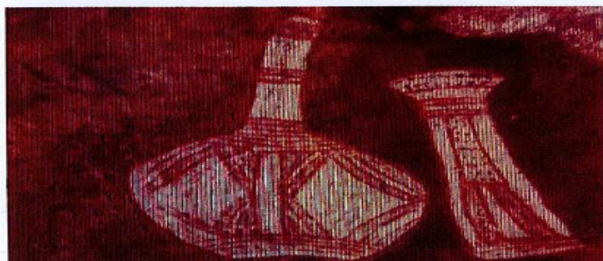
Aboriginal rock art painting of Makassan water and lime containers

Gallery opening hours 12.00 noon – 5.00 pm Tuesday – Sunday Closed ANZAC Day 25 April