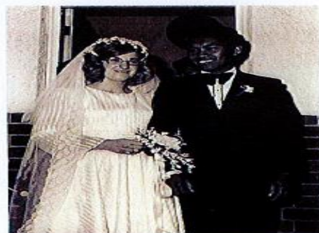
Makassan-Australian wedding WA 1972